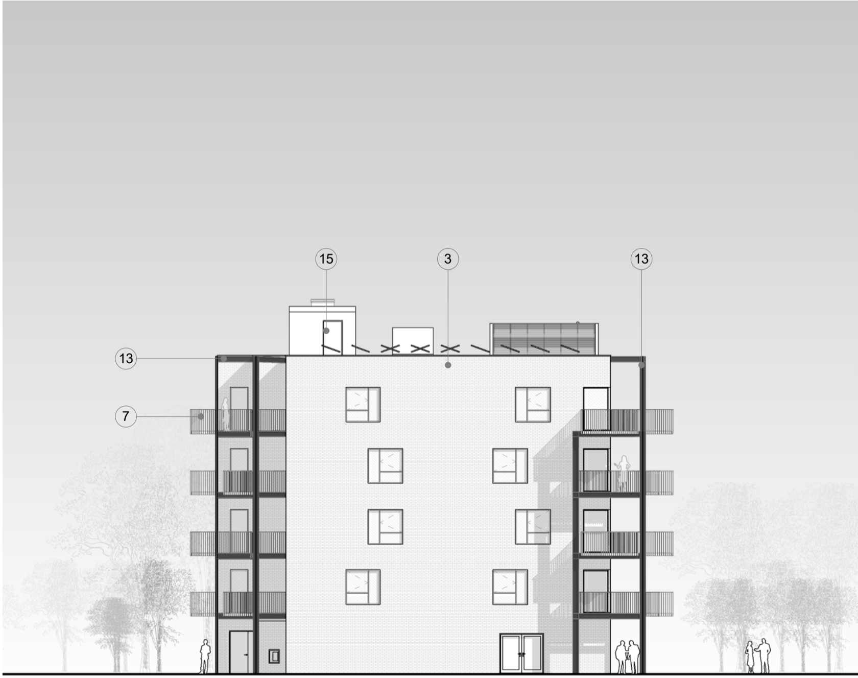
4 Building 12 - West Elevation 1 : 200

NOTES CONSULTANTS - Refer to highways consultant's drawings for details - Refer to landscape consultant's drawings for details - Landscaping layout is indicative only AREAS - Refer to area schedule © Copyright Reserved. ColladoCollins Architects Ltd