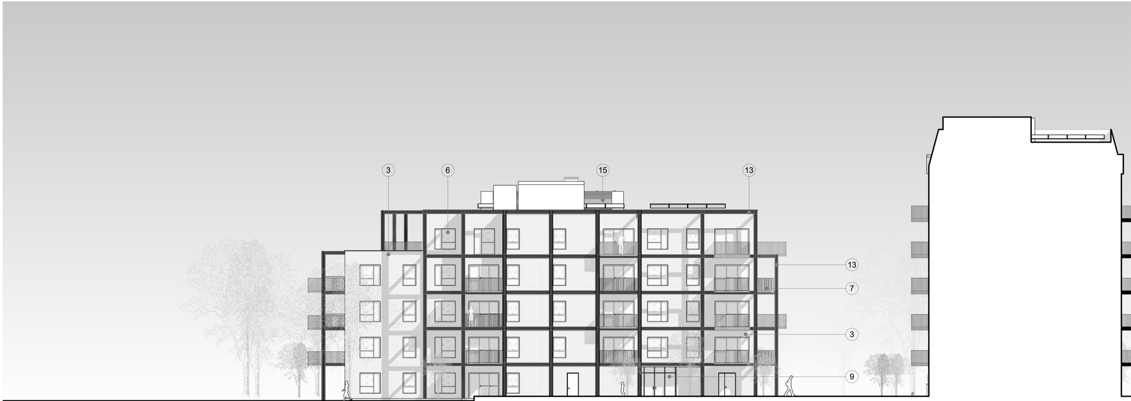
1 Building 12 - North Elevation 1 : 200