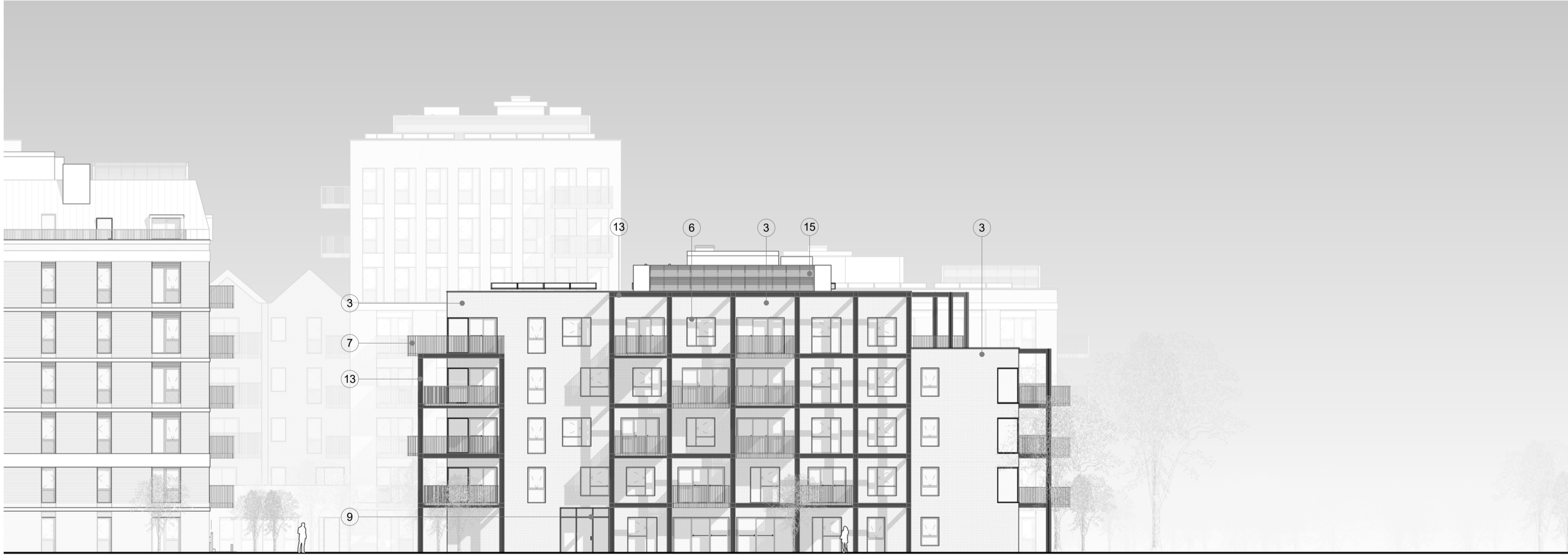
3 Building 12 - South Elevation 1 : 200