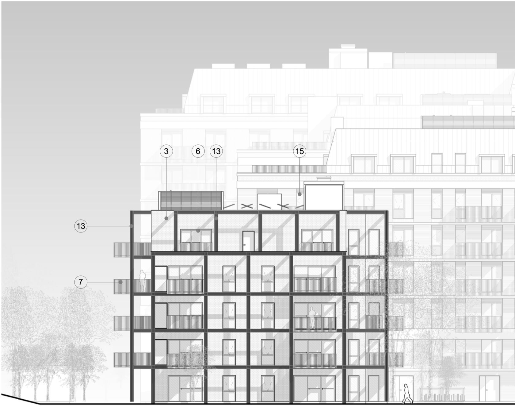
2 Building 12 - East Elevation 1 : 200